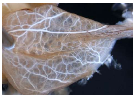
Innervation of the stomach in Suncus murinus