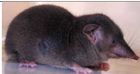
house musk shew ( Suncus murinus )

Furthermore, we conduct research on the receptor and transmission mechanisms of visceral pain. Specifically, we are carrying out studies to clarify the underlying mechanisms for visceral pain associated with chronic pancreatitis and fibrosis of the pancreas.